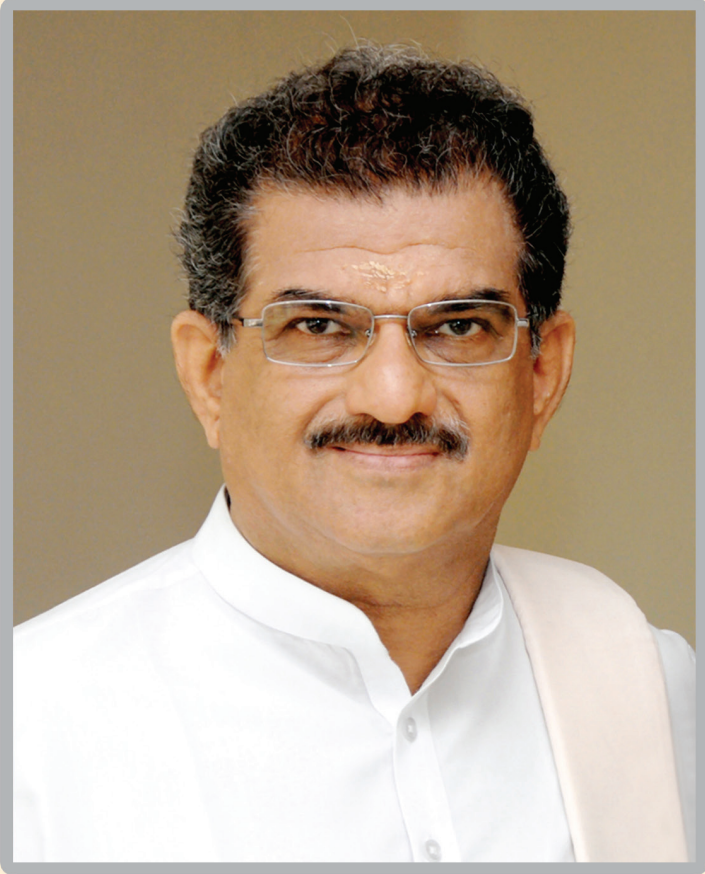
Padmavibhushana Dr. D. Veerendra Heggade