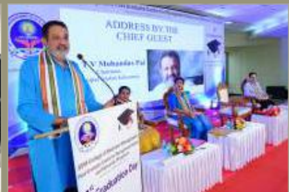
Graduation Day with Dr. Mohandas Pai as guest