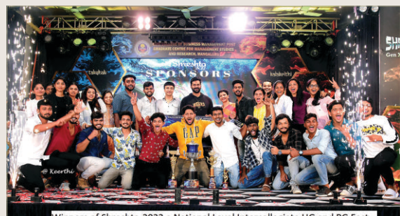
Shreshta - Intercollegiate Cultural and Management UG and PG Fest