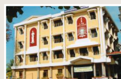
SDM Law College, Mangaluru