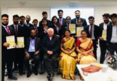
Faculty and student complete Taster's programme from City of Glasgow College, Scotland, U.K.