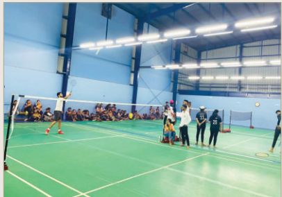
Annual sports meet