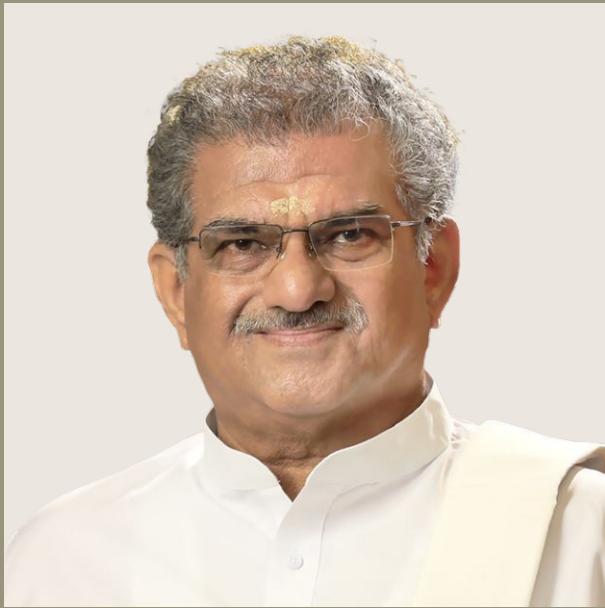
Padma Vibhushan DR. D. Veerendra Heggade President - SDM Educational Society ® , Ujire Honorable member of Rajya Sabha

T he Dharmadhikari of Shri Kshetra Dharmasthala, Padma Vibhushan Dr. D. Veerendra Heggade is a great visionary and a man of action. He has intensely devoted his life for the spiritual and social transformation of the society.