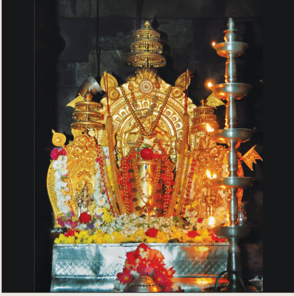
Shri Manjunatha Swamy