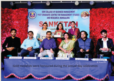
Gold medalists honoured