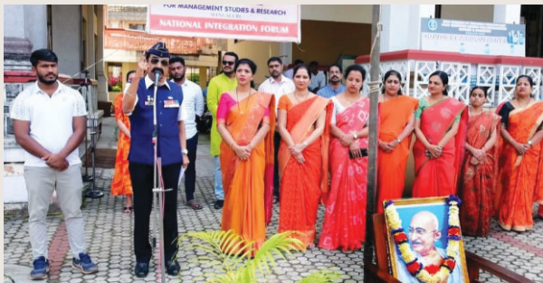
Gandhi Jayanti celebration