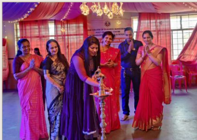
Dandiya with Alumni