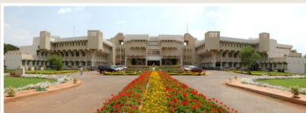
SDM College of Dental Science, Dharwad