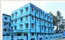
SDM & MMK Mahila Maha Vidyalaya Mysore