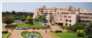
SDM College of Medical Sciences & Hospital, Dharwad