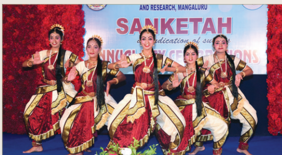
Culturals at its best

Tries make perfection and perfection is no try. Auditorium, air conditioned classroom, computer labs, conference room, counselling centre, library and top notch student amenities from the state of the art facilities housed in a beautiful structure of SDM PG Centre for Management Studies and Research. Besides this digital infrastructure for recording classes, online classes rich e-content, online courses have added more sheen to the MBA programme offered by our institute.