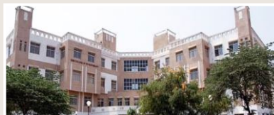
SDM College of Physiotherapy, Dharwad