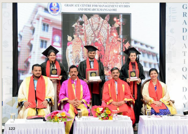
Gold medalists during Graduation Day

Institute has been taking initiative to offer short Term Certificate Courses on Event Management, Integrated Marketing Communication, Stress Management, Introduction to Banking System and Financial Planning in the area of Marketing, Human Resource and Finance. It has helped the students to take up job opportunities with multi-function roles.