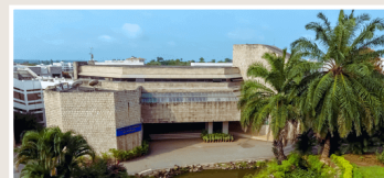
SDM College of Engineering & Technology Dharwad