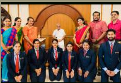
Visit to Shree Kshethra Dharmasthala