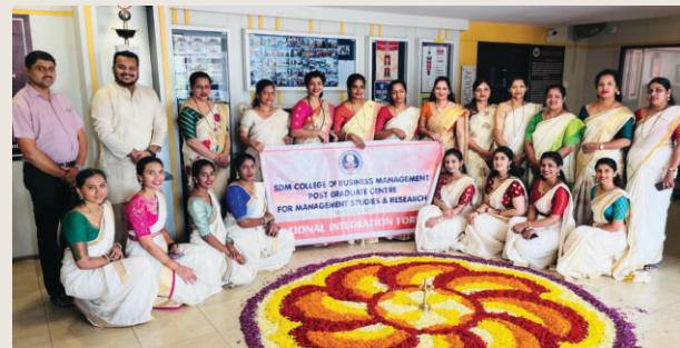
National Integration Forum celebrates Onam