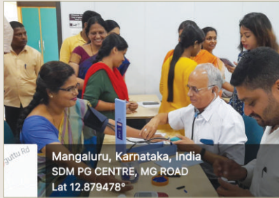
Youth Red Cross organizes Medical Camp