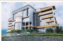
SDM Institute of Technology, Ujire