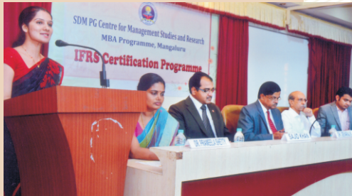
IFRS Certification programme