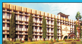
SDM Arts, Commerce & Science College, Ujire