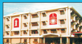
SDM Law College, Mangaluru