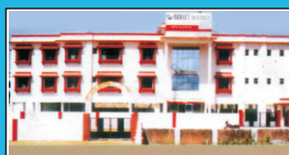
Rural Development & Self Employment Training Institute, Ujire