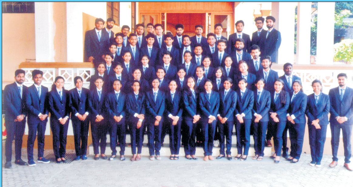
I MBA - A Section