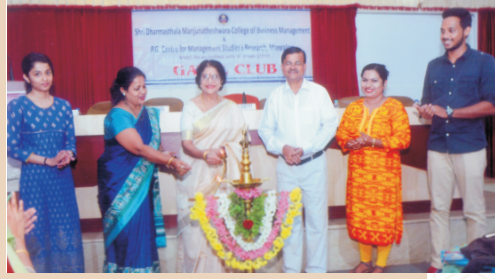
GAVEL Club Inauguration

The Institute in its quest to develop entrepreneurial excellence in students has collaborated with foreign university. It has a tie up with GRIMSBY University, United Kingdom for inter-student exchange program to enable them in having global exposure and enhancing their knowledge frontiers. The students at our institute had the rare feat of undergoing a taster programme on “Innovation & Productivity” at GRIMSBY University, United Kingdom. The institute looks forward to have more such programmes in the coming years.