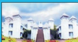
SDM College of Naturopathy & Yogic Science, Ujire