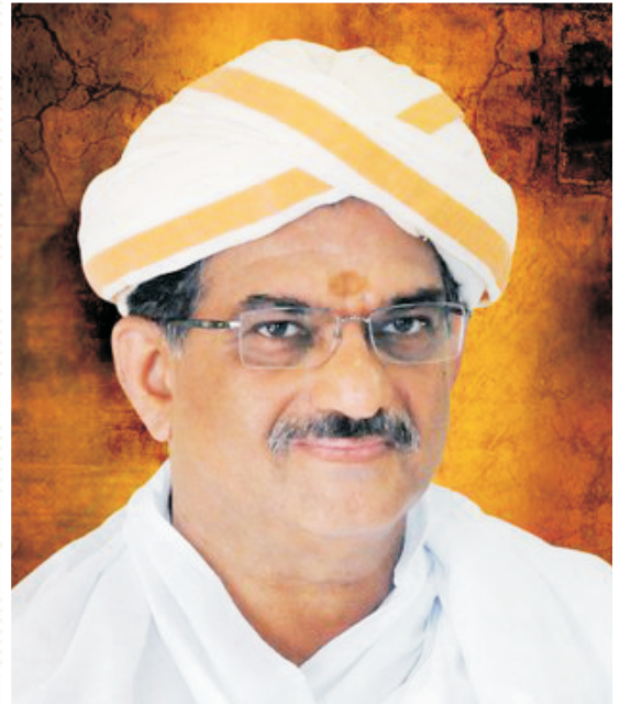
Padma Vibhushan DR. D. Veerendra Heggade

Padma Vibhushan Dr. D. Veerendra Heggade is the multi faceted personality who combines in him myriad roles of a friend, philosopher and guide. Above all He is a man of selfless dedication and working assiduously to uplift mankind by divinity, charity and guidance. Credit goes to Him for transforming Dharmasthala Kshetra into a giant organisation of social service and charity, the like of which is unprecedented in the annals of mankind.