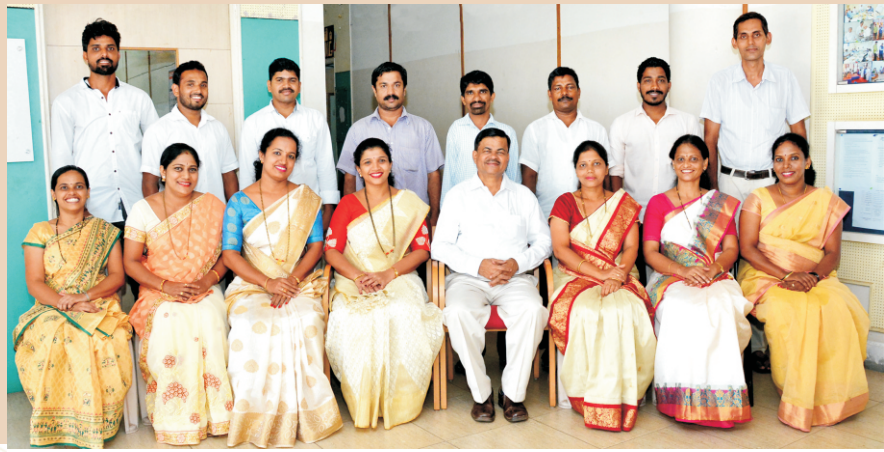
Non Teaching Faculty