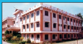
SDM & MMK Mahila Maha Vidyalaya, Mysore