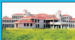
SDM College of Ayurveda and Hospital, Hassan