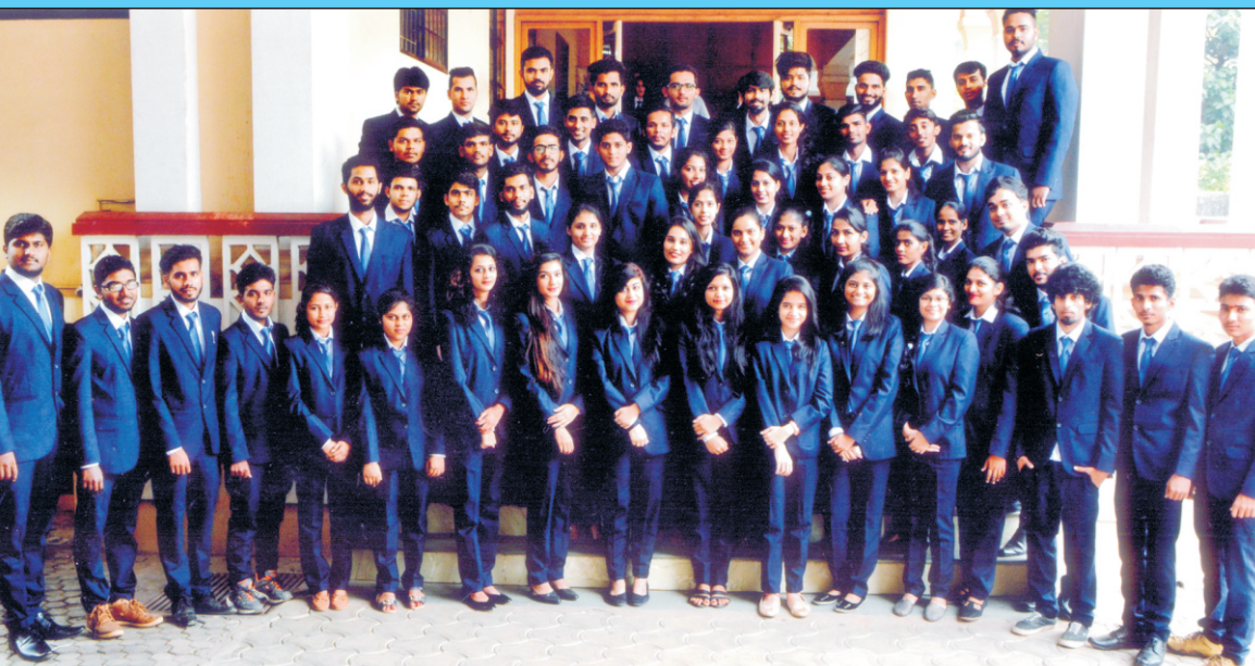
II MBA - B Section

Email :sdmcbm@gmail.com Website : www.sdmcbm.ac.in