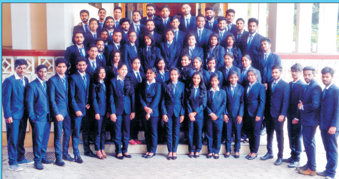
II MBA - A Section

The institute insists on 100% attendance from the students since the courses are run on a semester basis and students may loose a link in the course if they are absent for a few sessions. Leave or absence will be considered and sanctioned only in case of medical or other emergencies.