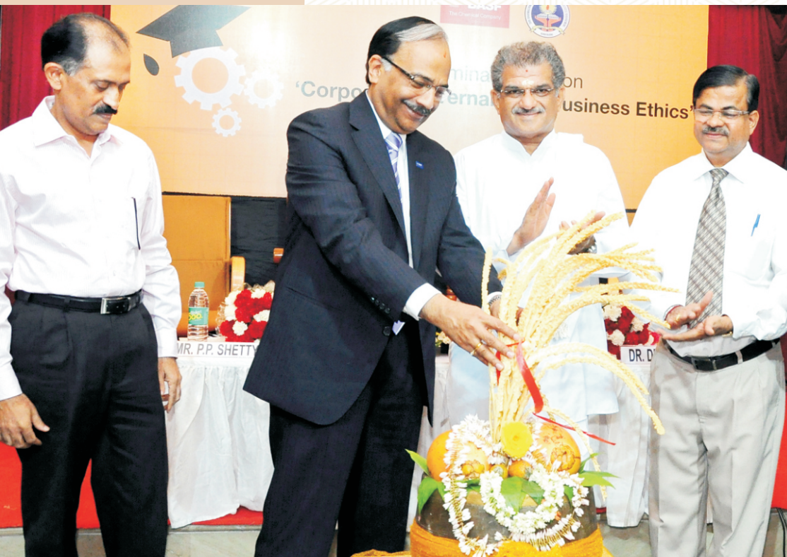
BASF Collaborative Programme