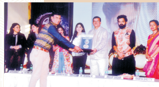
Annual Management Fest - Shreshta