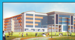
SDM Institute of Technology, Ujire