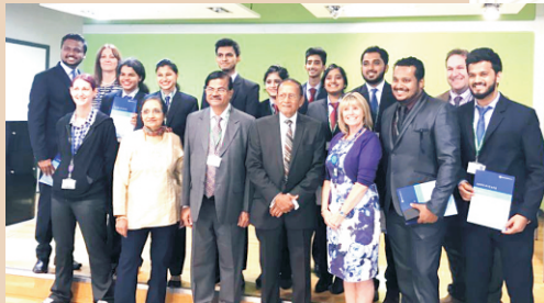
GRIMSBY University, UK programme