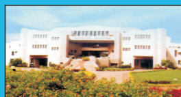
SDM College of Medical Sciences & Hospital, Dharwad