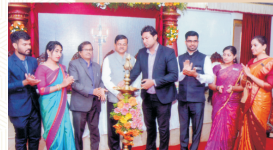
Annual National Conference

SDM Post Graduate Centre for Management Studies and Research is equipped with a Computer Lab which is one of the best among B-Schools in Mangaluru. It has state-of-the-art hardware, software and Wi Fi based Internet facilities.