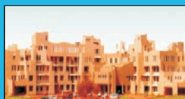
SDM College of Physiotherapy, Dharwad